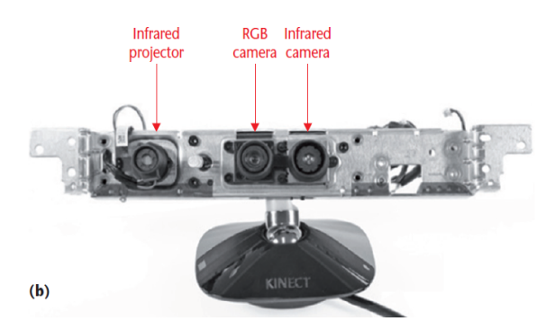
Fig. 1 (b) The components of the sensor.